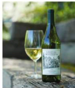
ABOVE: The ivy draping Chateau Montelena changes color with each season. OPPOSITE (clockwise): Bike rentals courtesy of the Napa Valley Lodge allow for exploring; an alluring brick fireplace at the Harvest Inn; outdoor patio serenity at the Napa Valley Lodge.

The golf cart veers past the vines neatly lined against a rocky road dividing the venerable Chateau Montelena Winery into halves. Riding in the back, I'm careful not to spill a drop of the ruby red 2005 Estate Cabernet Sauvignon because it's too tasty to waste. And it's not like we're going to get those 15 years back.