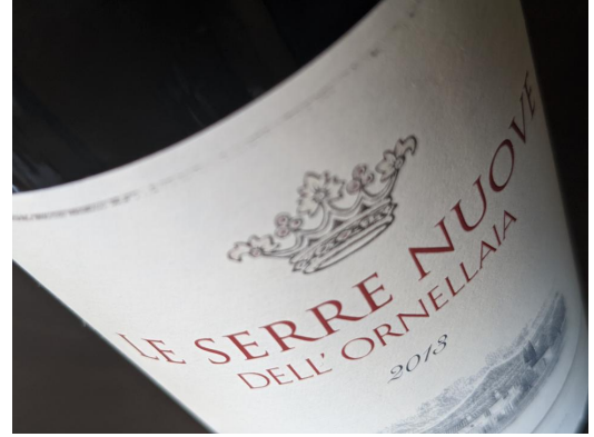
2013 Le Serre Nuove dell'Ornellaia CATHRINE TODD

August saw significantly lower temperatures which favored aromatic expression and led to a later than average harvest. This wine was going through a tight phase and so it took several hours for it to open and Axel noted that this is a more retrained, linear profile of Serre Nuove although he expects the wine to evolve past this stage. Granite and tar on the nose with dark fruit brooding in the background and spice on the extremely focused finish.