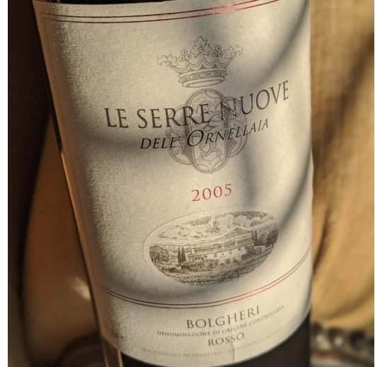
2005 Le Serre Nuove dell'Ornellaia