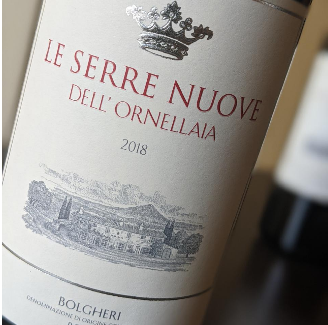
2018 Le Serre Nuove dell'Ornellaia CATHRINE TODD

2018 Le Serre Nuove dell'Ornellaia , Bolgheri Rosso DOC, Tuscany: 33% Cabernet Sauvignon, 32% Merlot, 18% Cabernet Franc and 17% Petit Verdot. “2018 is a slightly more balanced blend where none of the grape varieties completely sticks out but you can definitely feel a strong presence of both Cabernet varieties in this wine,” stated Axel. 2018 was not a hot or cool vintage overall as it was fairly warm for most of the year with no heat spikes and a good amount of rain. A beautifully aromatic wine with floral and fresh red raspberry notes that had a fine texture with crisp acidity and lovely balance of sweet fruit and savory dried herbs.