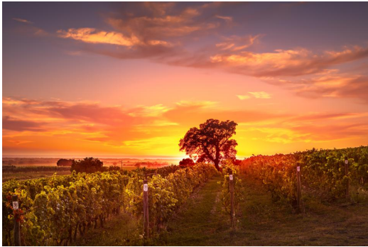
Vineyards in Bolgheri during Sunset with Tree in Background